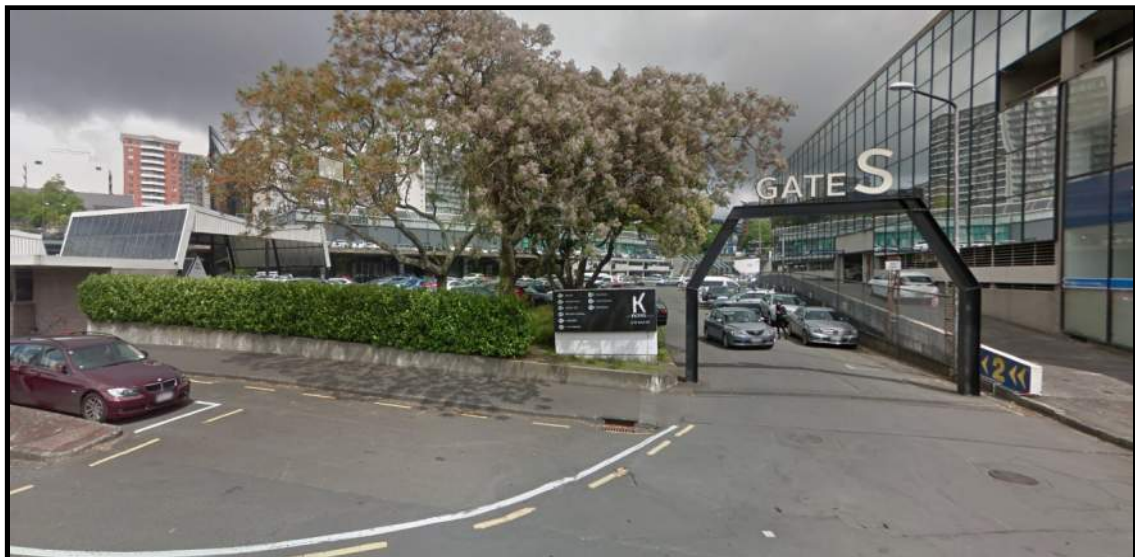
VIEW OF SALE STREET ENTRANCE (GATE S) TO CARPARK